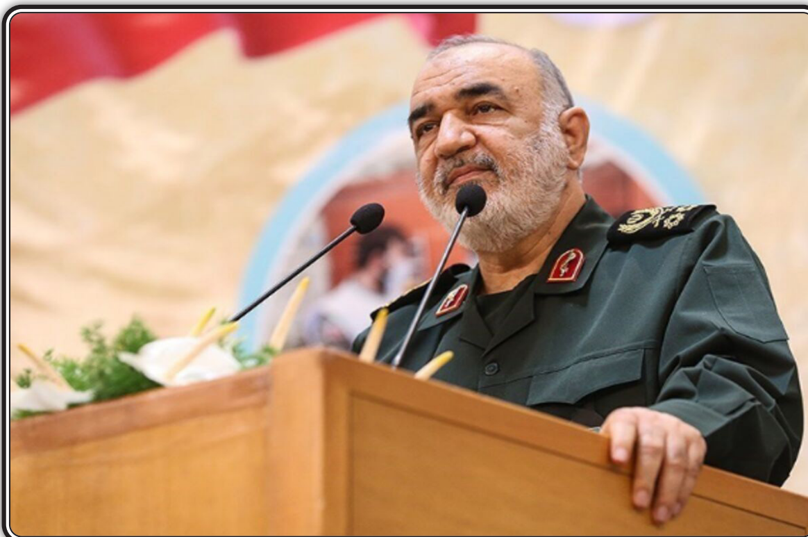
Chief commander of the Islamic Revolution Guards Corps (IRGC) Major General Hussein Salami

TEHRAN -- The chief commander of the Islamic Revolution Guards Corps (IRGC) on Saturday praised the Yemeni nation for courageously and valorously defending the Palestinian nation amid the bloody Israeli onslaught in Gaza, stating that the people will ultimately emerge triumphant.