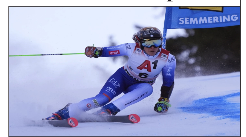
Italy's Federica Brignone speeds down the course during an alpine ski, women's World Cup giant slalom race in Semmering, Austria, Saturday, Dec. 28, 2024.